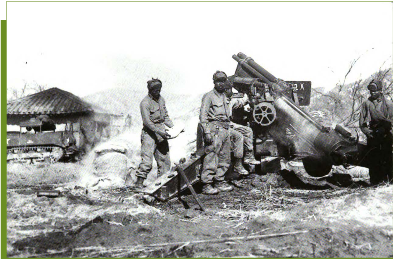
Gun of Battery B, 503rd Artillery, in action in Korea, 1951.