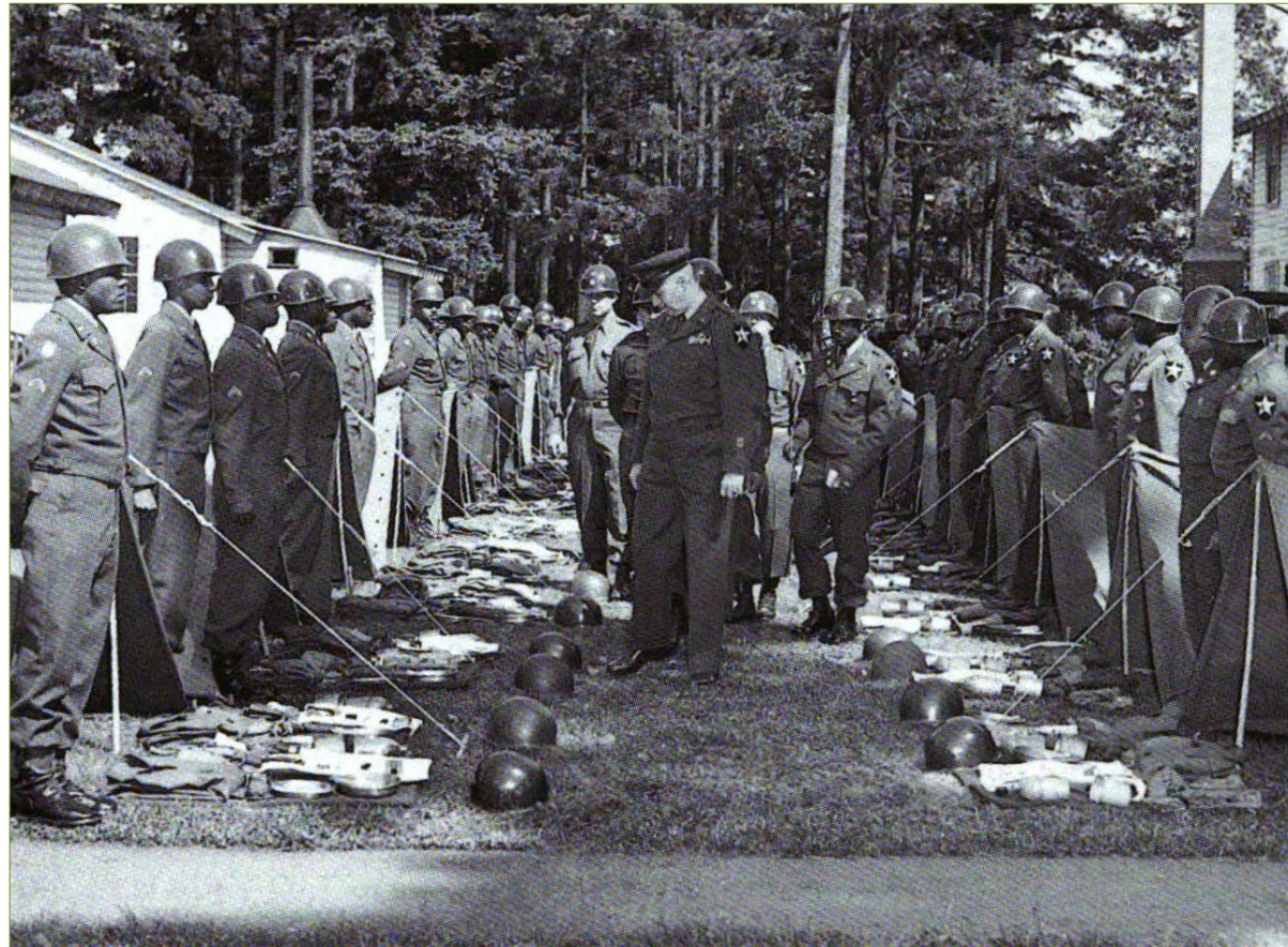
503rd Artillery undergoing inspection, Washington State, 1950.