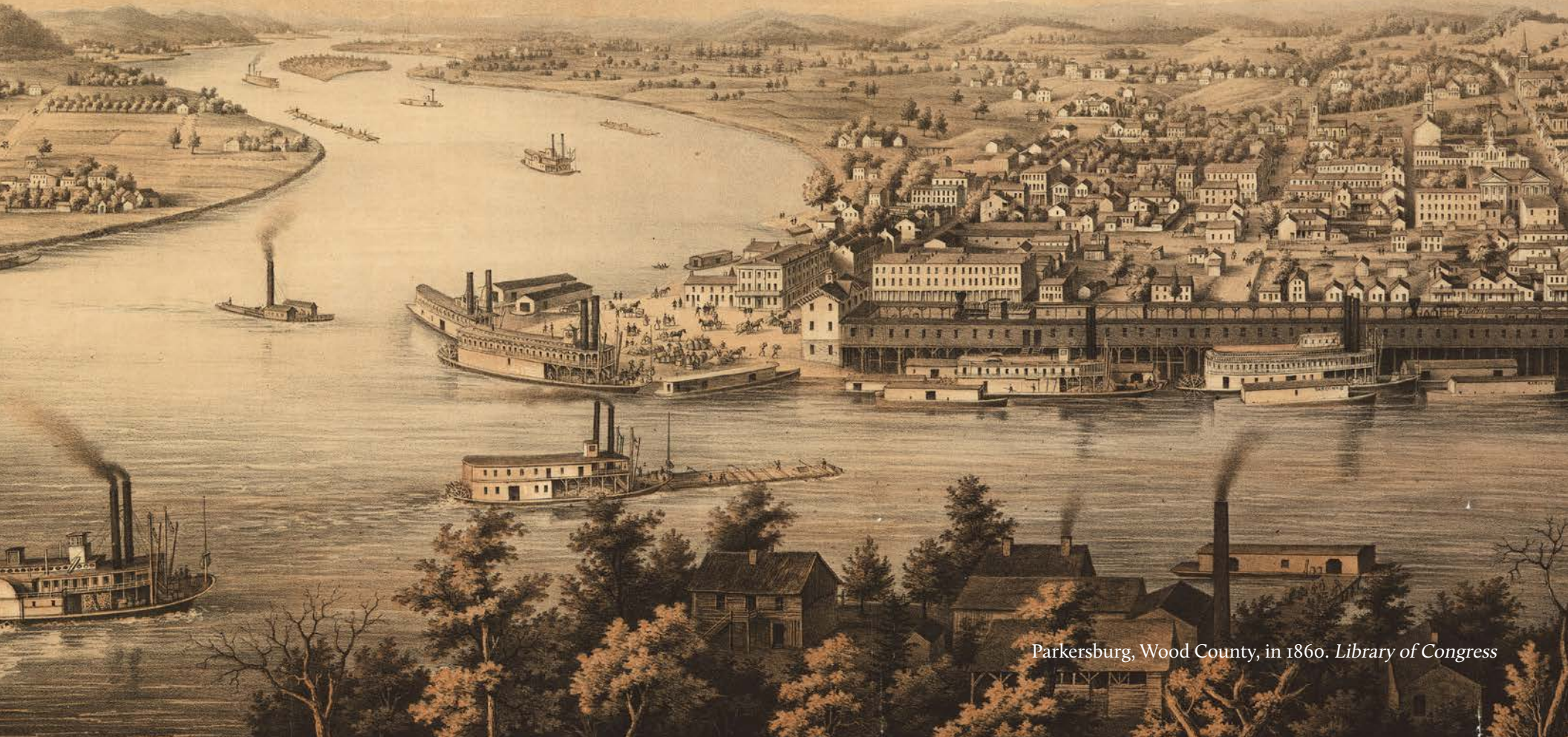
Parkersburg, Wood County, in 1860.

Click on any entry for a West Virginia Encyclopedia article on that topic