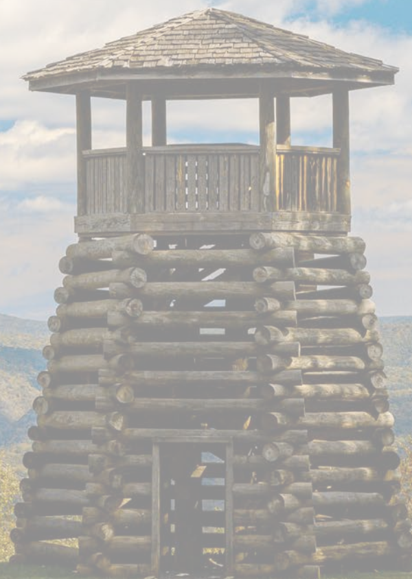
Observation tower at Droop Mountain Battlefield State Park, which overlooks the Union approach route in the valley below.