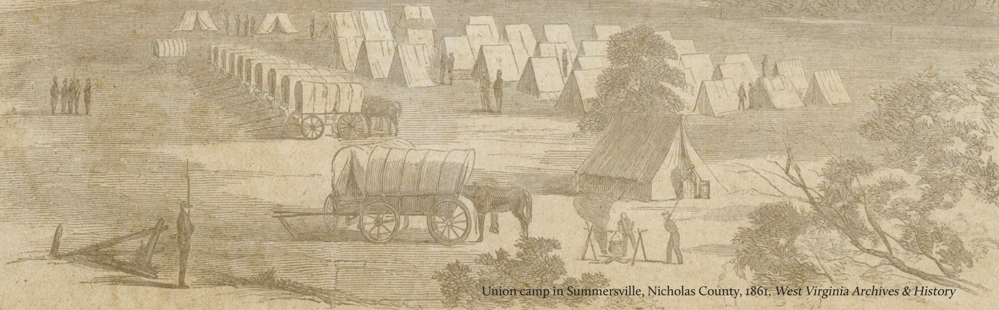
Union camp in Summersville, Nicholas County, 1861.

National Park Service extensive list of West Virginia battles and skirmishes