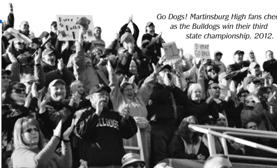
Go Dogs! Martinsburg High fans cheer as the Bulldogs win their third state championship, 2012.

Visit www.wvhumanities.org for applications and guidelines, or call (304)346-8500.