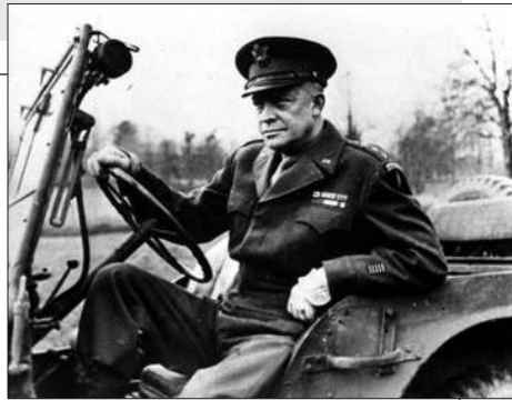
General Dwight D. Eisenhower, Supreme Allied Commander, at the wheel of his jeep somewhere in France, December 28, 1944.