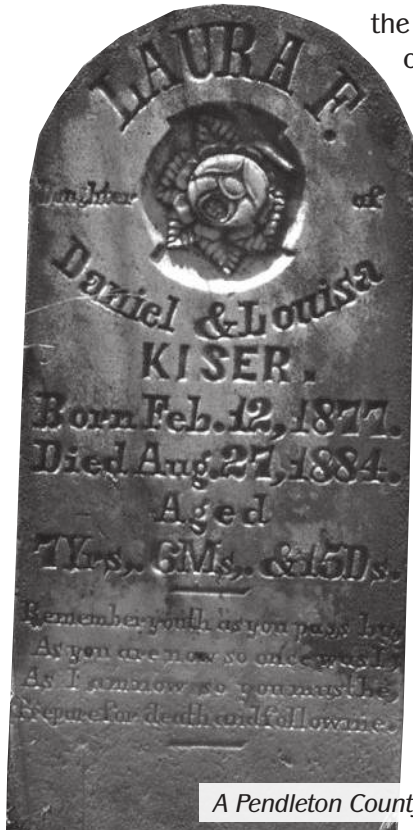
A Pendleton County gravestone.