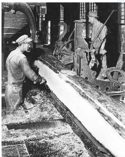
Workers at Meadow River Lumber Company, about 1940.

The West Virginia Humanities Council partners with the Smithsonian to present national traveling exhibits to West Virginians.