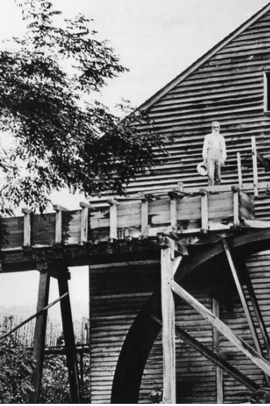
Noah Cowger at the family mill, about 1900.

Visit the West Virginia Encyclopedia at wvencyclopedia.org .