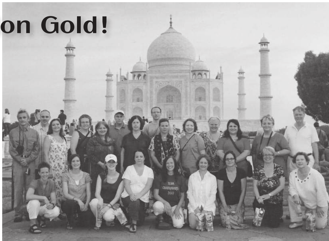
Our author (front row, fourth from left) with other West Virginia teachers at the Taj Mahal.

“Congratulations,” the letter read, “you have been chosen...”