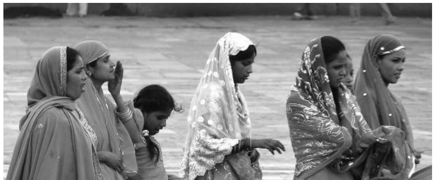
Indian women at Fatehpur Sikri.

I've always told my students that nothing beats experiencing art in person. Taking it further, I believe that you really don't appreciate a culture until you experience it from the inside. In a time when it seems that so many groups are at odds, bringing cultural appreciation into the classroom is crucial. When I dressed in a sari and shared my experiences with my school's senior theology classes, the feedback suggested those students had gained a better understanding of Indian people and their ways of life. Understanding leads to peace, so in a small way