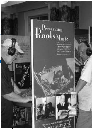
Visitors enjoy the New Harmonies exhibit in Grafton.

Visit www.wvhumanities.org for applications and guidelines, email saunders@wvhumanities.org , or call (304)346-8500.