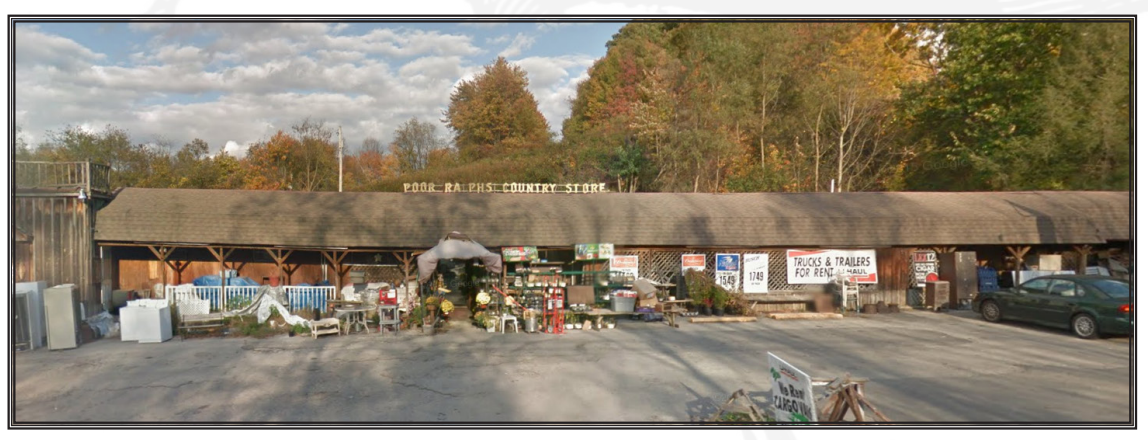
Ralph's Country Store near Philippi carries on the memory of its brave namesake.