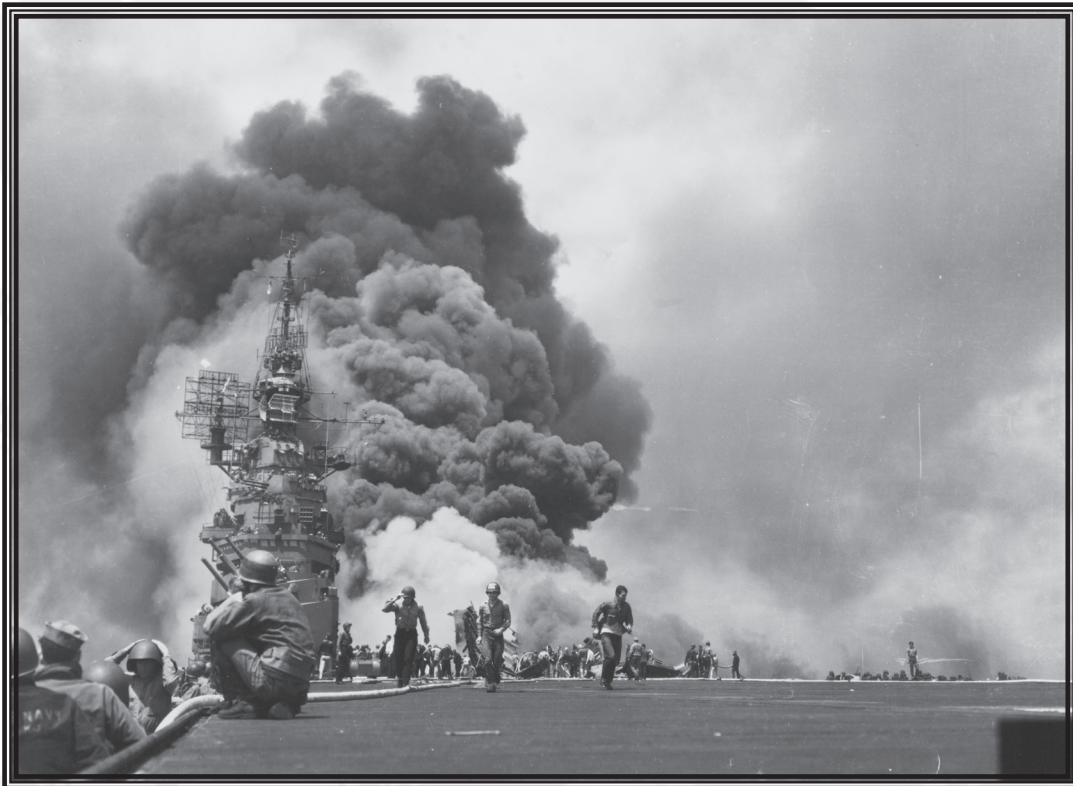
In one of the most famous naval photographs of World War II, smoke billows from kamikaze impacts near the “island” of USS Bunker Hill (CV-17) on 11 May 1945.