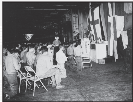
A Catholic memorial service held aboard Bunker Hill after the tragic attack.