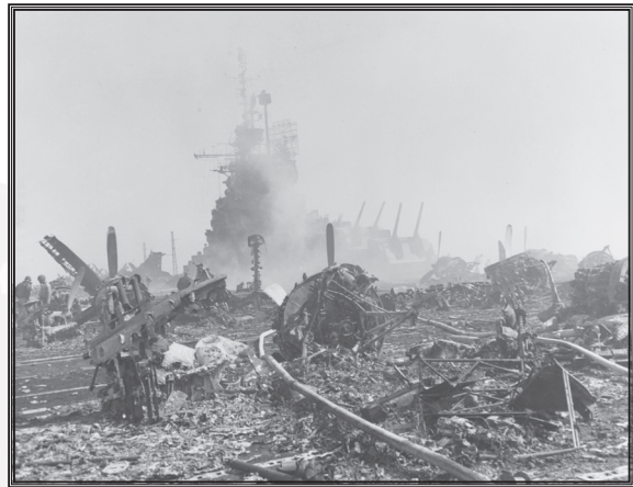
The husks of aircraft on Bunker Hill 's shattered flight deck. Burning fuel from the kamikaze aircraft dripped down onto lower decks, and the resulting smoke suffocated men in the Lewellyns' duty area.

The twin brothers were merely 19 years old. They had celebrated their birthdays only ten days earlier. On May 12, 1945, the longest burial at sea in U.S. Navy history commenced onboard the USS Bunker Hill . Beginning a few minutes past noon and continuing until just before sunset,