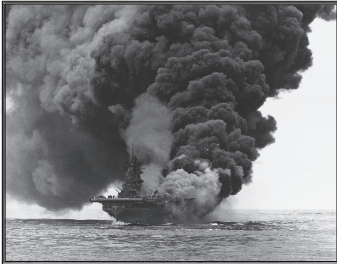
USS Bunker Hill burns fiercely off Okinawa after two kamikaze hits. The ship's bakery where the Lewellyn twins worked was located on the port side, near the lighter gray smoke pictured. NARA, 80-G-274266

After two weeks of rest and refueling in March 1945, the USS Bunker Hill joined a task force group supporting the U.S. Marine landings on Okinawa—a large island that was to serve as a final staging ground for future attacks on Japan. Bunker Hill 's fighter squadrons shot down Japanese aircraft, engaged enemy ships, and provided air support for the Marines battling across the island. Pacifying Okinawa's Japanese defenders proved to be a long, bloody task—and not only for the marines and army units ashore. The supporting navy fleet was savaged by the largest number of kamikaze attacks witnessed during the Pacific War.