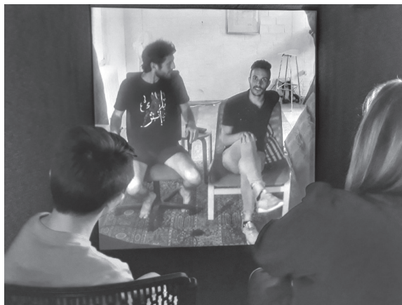
Visitors in the Hardy County Portal.

For more information about the project, visit www.sharedstudios.com .