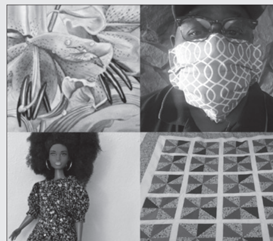
Items collected as creative responses to COVID-19

◀ Civil War era cannonball discovered during MacFarland-Hubbard House renovations